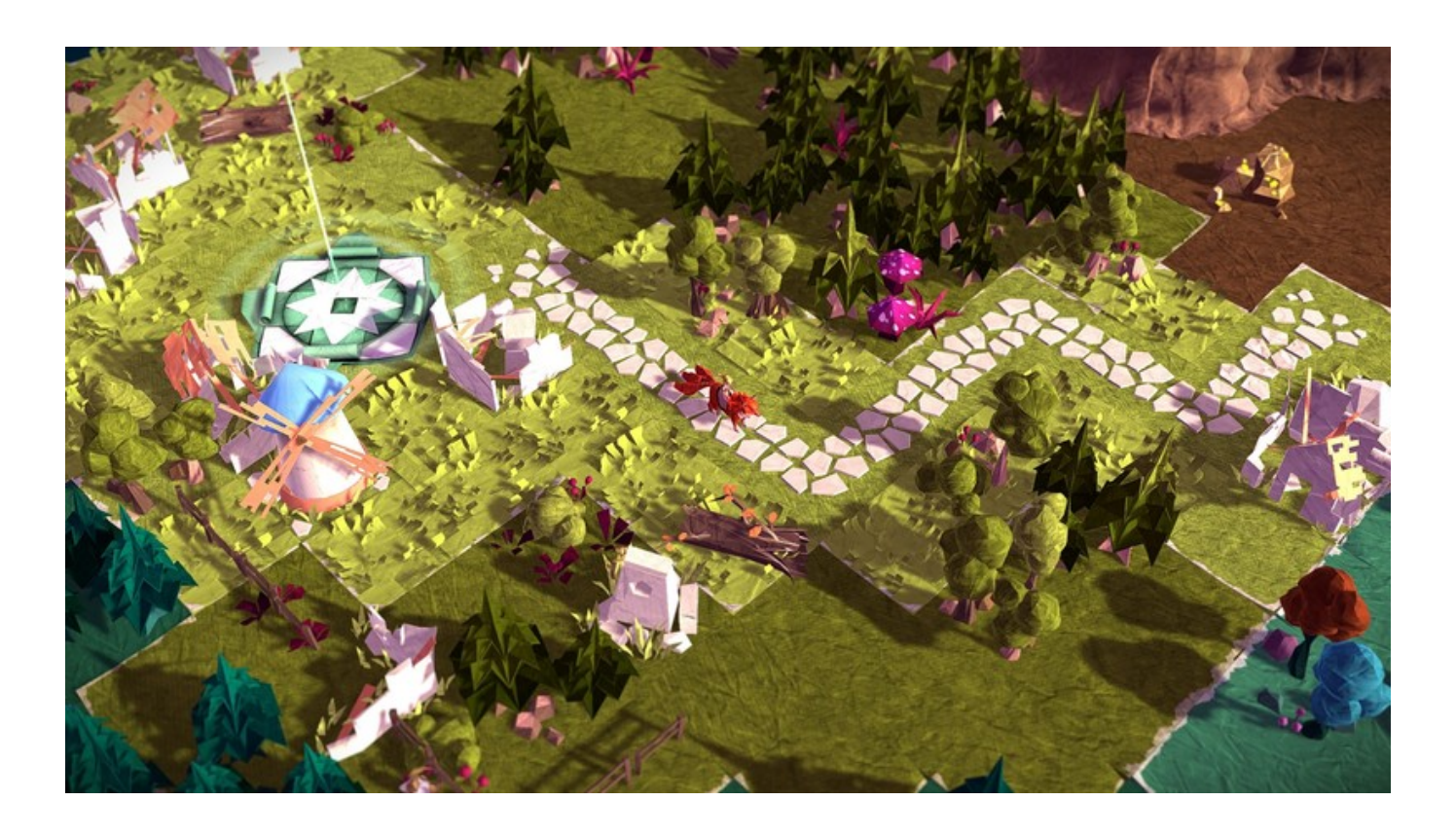
Epistory - Typing Chronicles Download] [Patch]

Download ->>->> <a href="http://bit.ly/2SO7Ihz">http://bit.ly/2SO7Ihz</a>